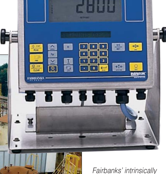
safe 2800 Series indicator is designed to perform with virtually any scale system. It is perfect for numerous chemical and food processing applications such as manual batching, auto batching, setpoint and PLC interfacing via 4 to 20mA.