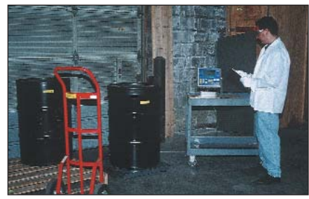
The 2800 Series is the first Fairbanks' indicator with the ability to operate in hazardous environments and feature our exclusive, digital, load cell communications technology, Intalogix® Technology.