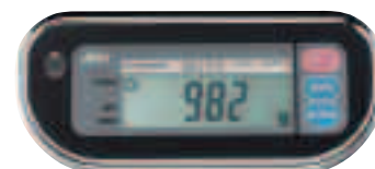
Metric mode, SK-WP models