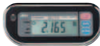
Lb mode, SK-WP models