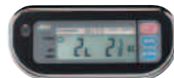
Lb/fractional oz mode, SK-WPZ models