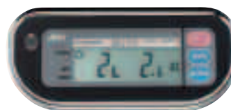
Lb/decimal oz mode, SK-WPZ models